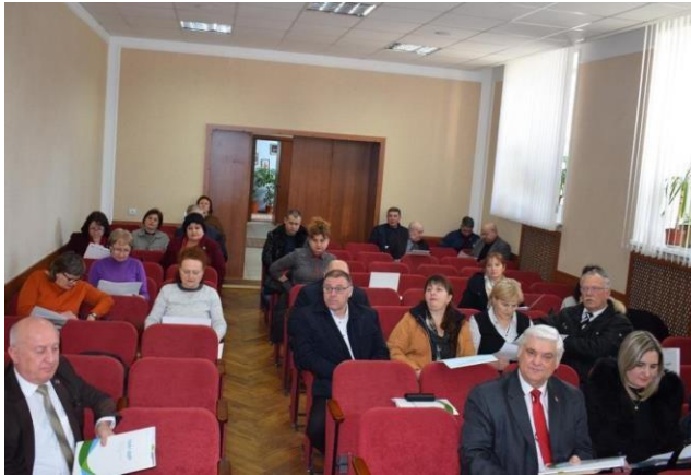
Presentation of the "Aging and Health" Project, Edineț District Council – January 23, 2020