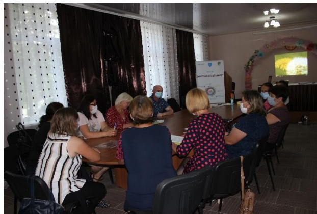
Information session on the establishment of the initiative group – Feteşti village, Edineţ r