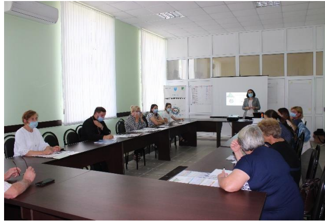
Age Friendly Community Training – CCL Parcova, Edinet