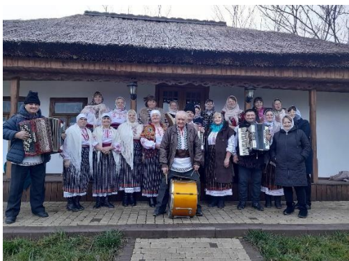
Meeting organized on the occasion of Saint Andrew by the Initiative Group from Sărata Veche