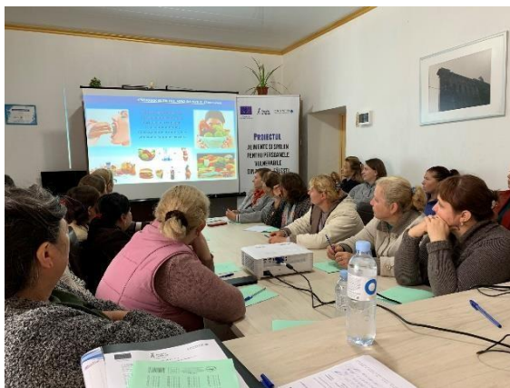
Training "Correct nutrition - the first step towards a long and healthy life" in the village of Izvoare