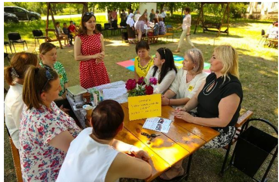
Hand and face care lesson held in Taxobeni commune during Change Week through the Age Friendly Community