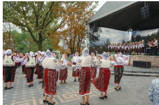
Bunica i Bunelul Fest: Artistic developments and traditional dances