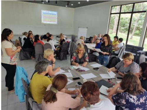
"Community Mobilization" Training