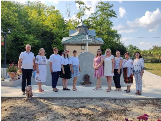
The launch of the mini grant in the village of Izvoare