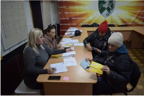
Distribution of vouchers for the purchase of food, clothing and footwear