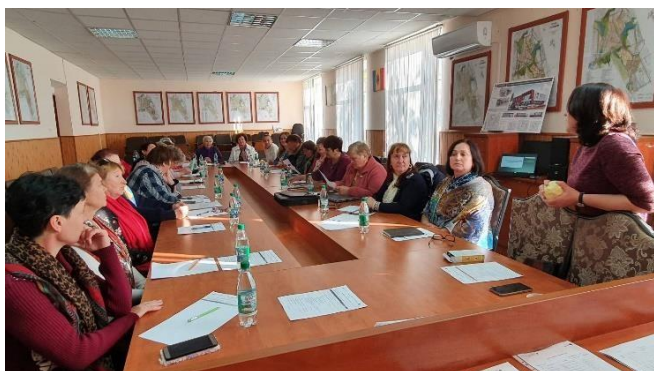
Exchange of experience between Initiative Groups from Fălești district