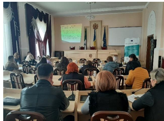
Discussion workshop on employment opportunities for people with disabilities and legal aspects with the participation of employers in the district, representatives from ANOFM, DASPF, CASMED and the Legal Clinic.