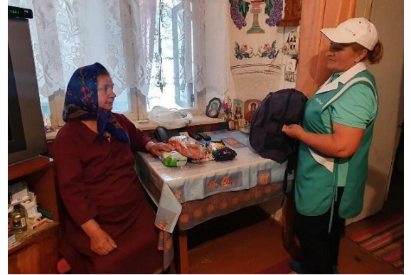
The social worker does shopping for the beneficiaries, Marăndeni village