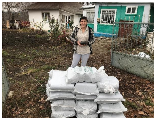
Distribution of solid fuel for host families