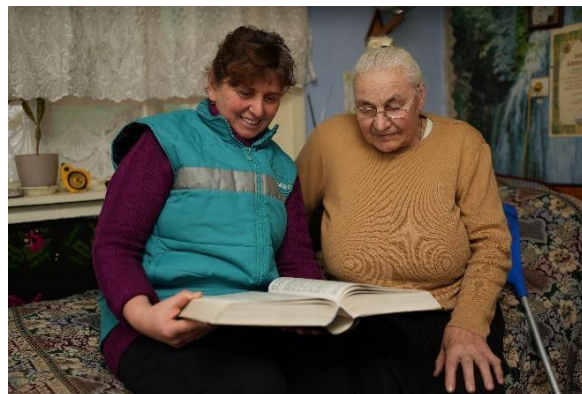
Social care services at home - Viișoara village