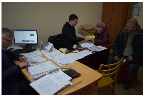
Distribution of vouchers for the purchase of food products and clothing