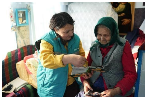
Social care services at home - s. Corpaci