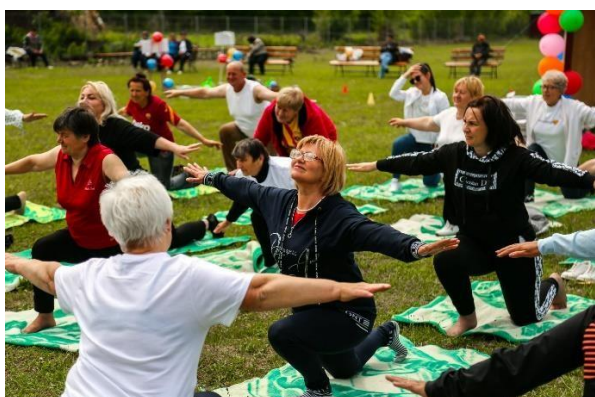
Yoga for seniors held during Change Week through the Age-Friendly Community. Viișoara